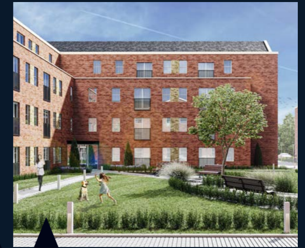
CRESCENT HOUSE Rugby