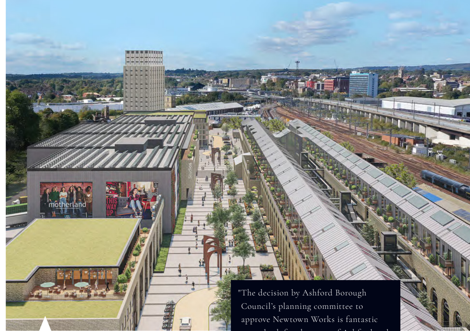
CGI of Ashford International Studios, courtesy of Quinn Estates.

In 2020 planning permission was granted for the ambitious £250m film studio-led regeneration of Newtown Works - a derelict railway works in Ashford.