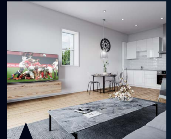
STRATFORD VILLAGE London