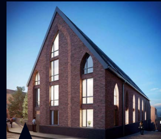
NEW SCHOOL HOUSE Birmingham