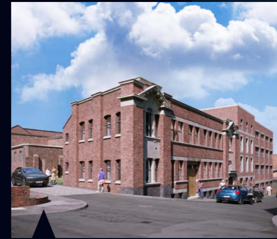
THE COPPERWORKS Birmingham